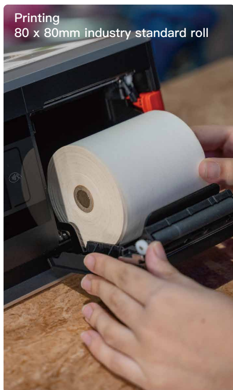
Printing 80 x 80mm industry standard roll