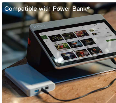
Compatible with Power Bank*