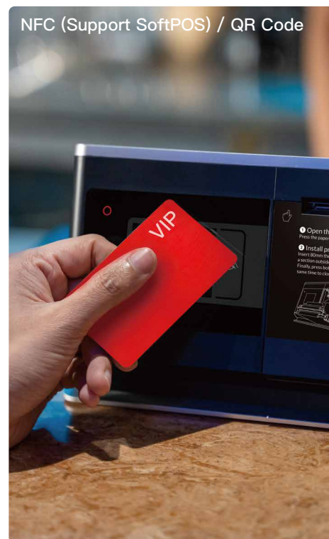
NFC (Support SoftPOS) / QR Code