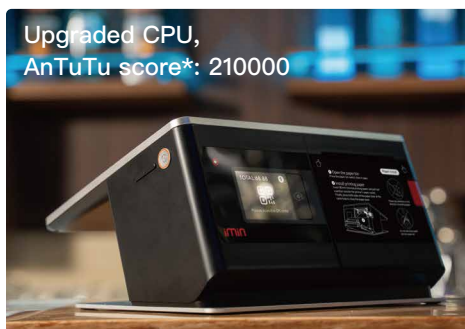
Upgraded CPU, AnTuTu score*: 210000